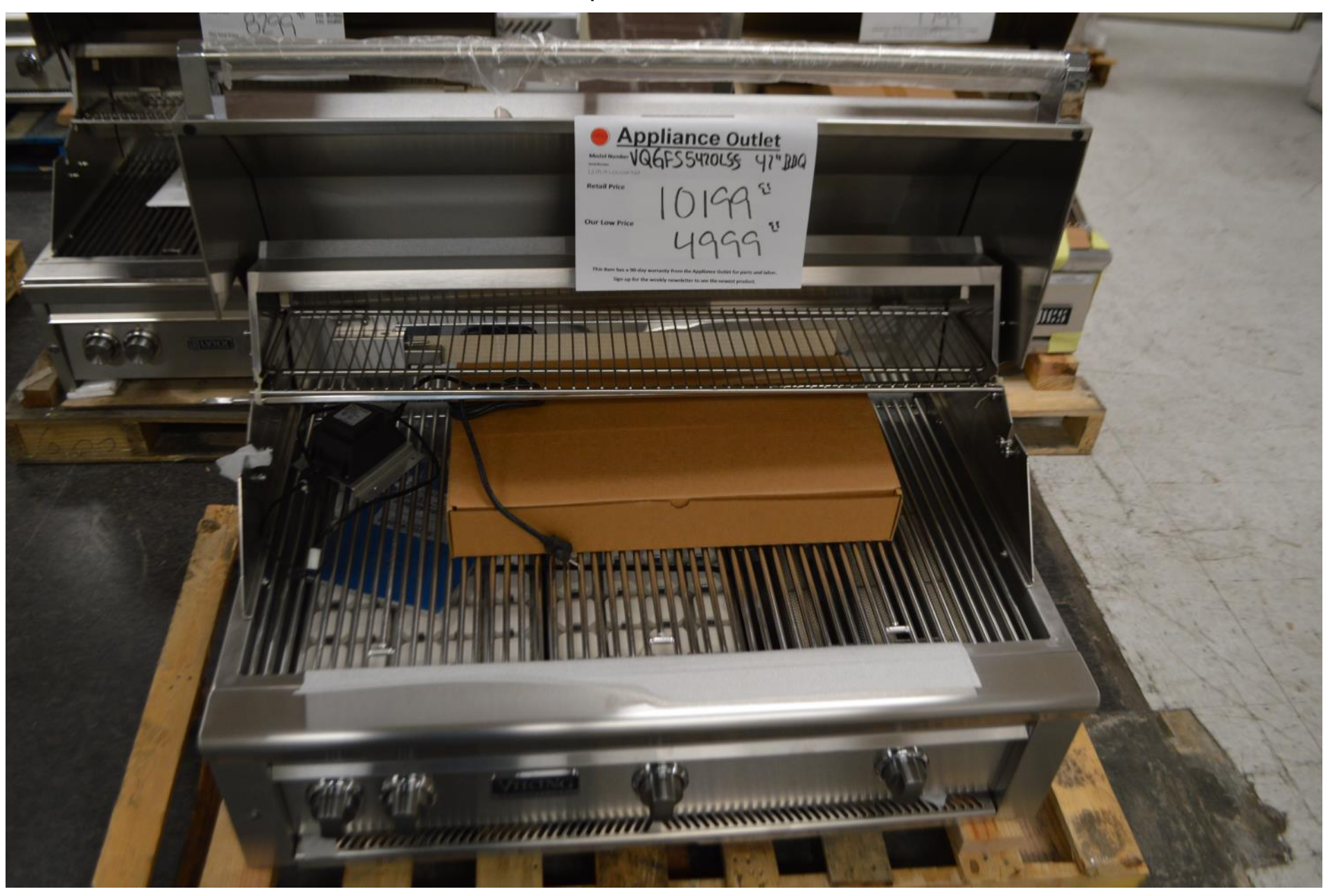
Viking 42" BBQ grill head with sear area and rotisserie $ 4999.99